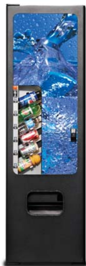
Summit 300 Satellite